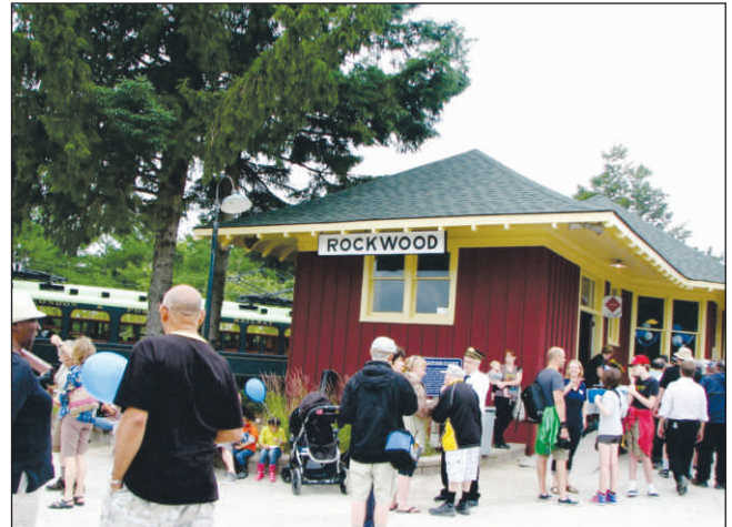
The second photo shows some of the crowd in attendance at the station enjoying some birthday cake being served at the entrance to the station to mark this special occasion.