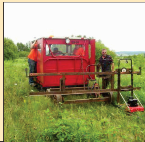
Three photos: above is a student & a bush hog, centre, our chief of maintenance & chain saw, and the right photo shows one of our mechanics making some final adjustments and giving some instructions on the Division's customized R.O.W. clearer – Totally unique!