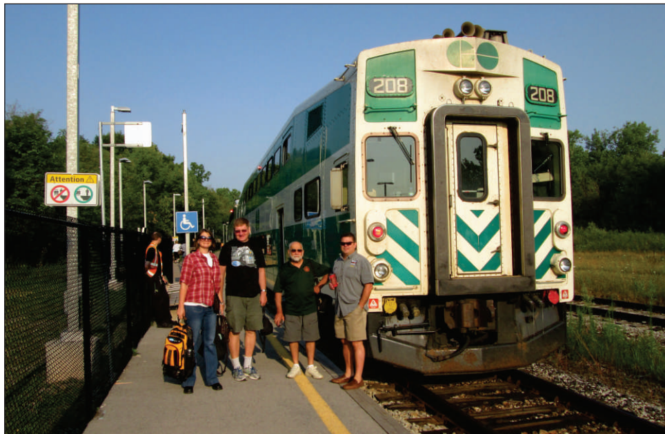
Fifteen Niagara Division Members took part in the GO Trip adventure to Toronto and beyond to Aurora, north of the city. This photos shows a few of the bright-eyed early arrivals in Niagara Falls station before the morning departure..

In early August the Division did their Second annual GO Train trip. GO Trains only travel to Niagara in the summer, and thus far, only on weekends. This year Members took the train to Toronto Union Station then toured Roundhouse Park, a short walk from Union (with the CNR Northern 6213 and a GP-7 on display); visited Steam Whistle Brewery that is in one end of the CP roundhouse, then took the GO Train to Aurora, located on the Barrie line. A lunch stop was made at a watering-hole next to the old Aurora station then back home via Toronto ... all in 12 hours.