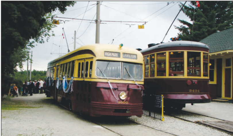
The first photo shows TTC PCC #4000 alongside TTC Peter Witt car #2424.

The Division held an excursion on July 19, 2014 to the Halton County Radial Railway to participate in their 60th anniversary celebrations. The HCRR is a transit museum, and is located at Rockwood, Ontario just east of Guelph and was founded in 1954.